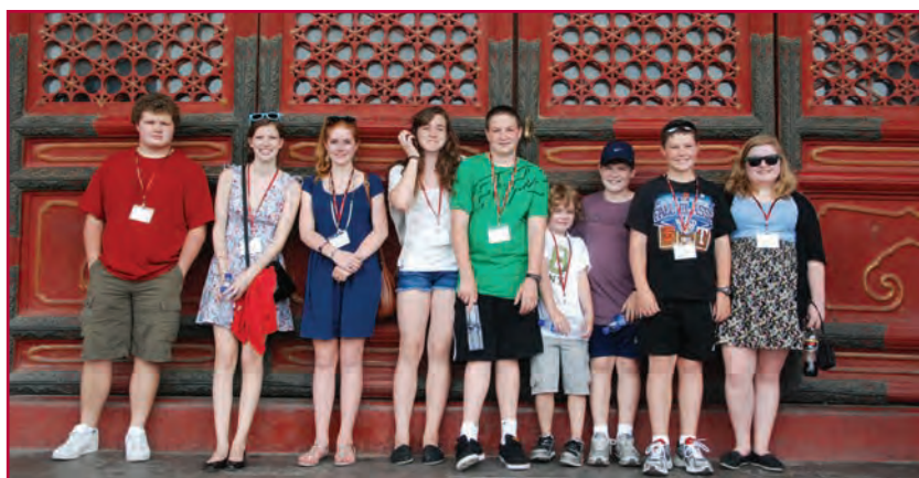
Young participants from Dartmouth's 2011 China Tour for Families