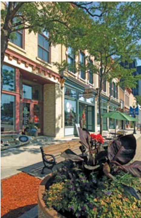
Lovely Sheboygan, Wisconsin

Arrive in beautiful Mackinac Island, a Victorian-era haven where cars are forbidden and bicycles share the road with horse-drawn carriages. Explore this idyllic island and see the ancient limestone formations that were considered sacred by the Straits Indians; the impressive Fort Mackinac, built atop a high cliff by the British in 1780; and the landmark Victorian Grand Hotel. Also enjoy free time to stroll along streets lined with ginger-bread-trimmed buildings and browse in the charming shops. (B, L, D)