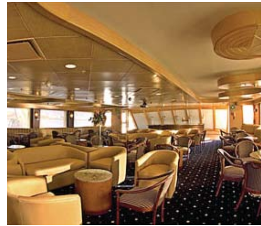
The spacious lounge, ideal for reading, relaxing, and conversation