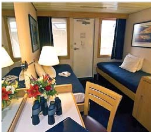
Cabins face outside and feature attractive amenities