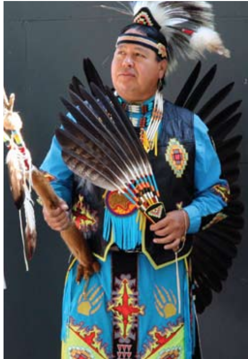
Ojibwe Dancer, Manitoulin Island