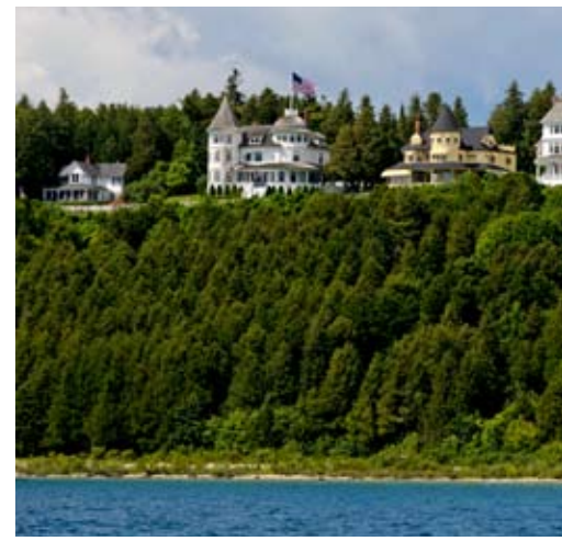
Victorian homes line Mackinac Island's coast