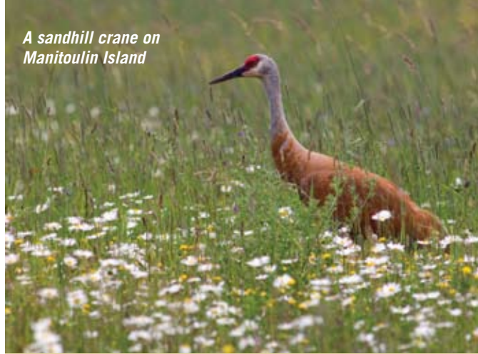
A sandhill crane on Manitoulin Island

PRSRT STD U.S. Postage PAID Hackensack, NJ Permit No. 291