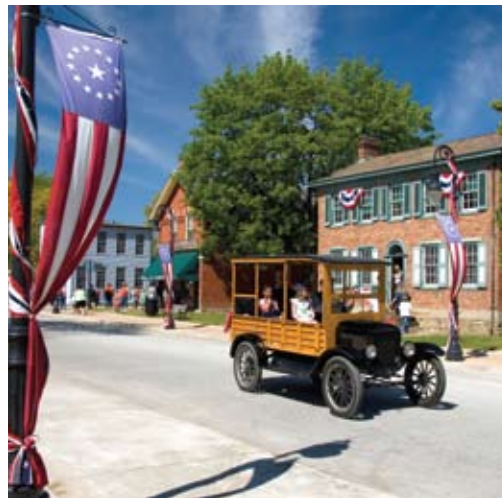
Henry Ford Museum and Greenfield Village, Michigan