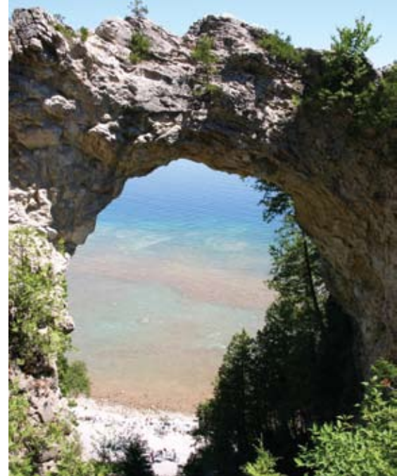
Arch Rock, Mackinac Island

Rates: $295 per person, double occupancy; $175 single supplement