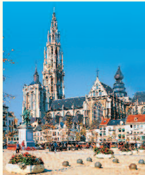
Antwerp's 16th-century Cathedral of Our Lady was inscribed on the UNESCO World Heritage list of Belfries of Belgium and France in 1999.

Since the 17th century, flowers have been a major Dutch industry. Visit the Aalsmeer Daily Flower Auction, the world's largest, where the international market prices for flowers and plants are determined each day. Almost 19 million flowers are sold to distributors each day in the world's third largest building (10.6 million square feet).