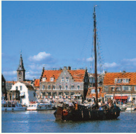
Step back in time in the charming port of Volendam, a traditional Dutch fishing village.

thoroughfare is lined with colorful cafés and purveyors of fresh fish, handmade cheeses and a myriad of traditional crafts.