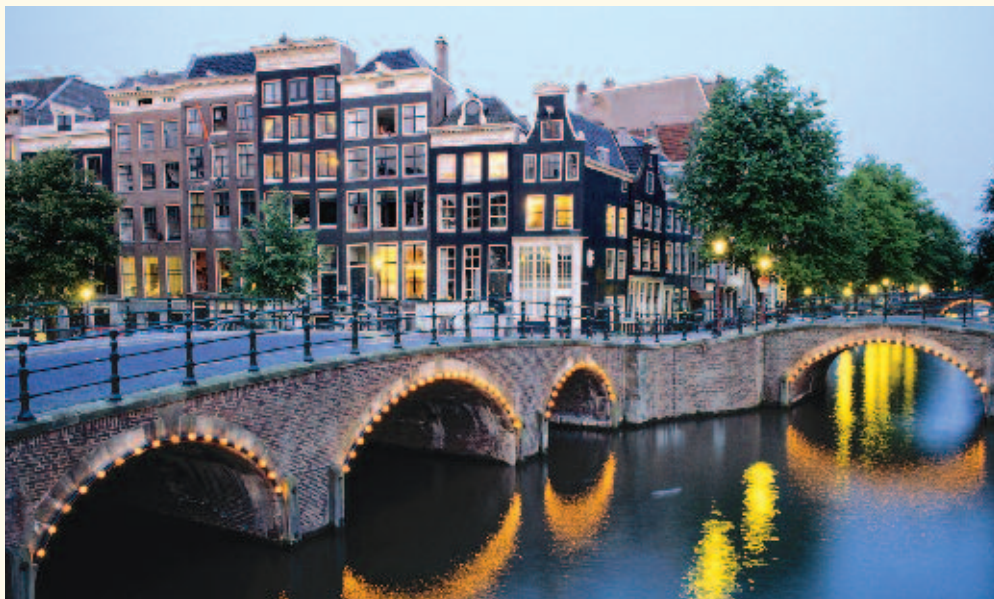
Amsterdam's charming bridges and picturesque canals bring the intimacy of a small town to one of Europe's most celebrated cities.

Eighteenth-century row houses, sleepy canals and a picturesque waterfront evoke the glory days of the Zuiderzee and typify the beauty and charm of the Dutch fishing port of Volendam, where many residents still don the traditional dress of the region. Built along the top of a dike, the village's primary