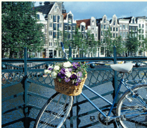
Historical Amsterdam is a city of canals and charming 16th- and 17th-century merchants' houses.