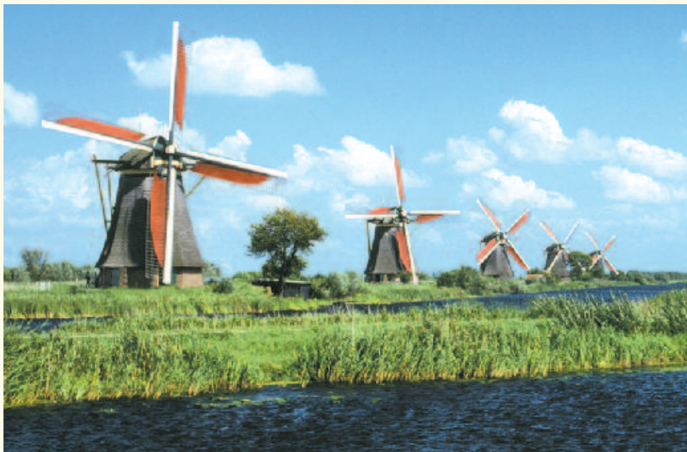
Tour authentic 18th-century windmills, the perfect examples of innovative Dutch engineering, at Kinderdijk. Inset above: Many residents of Volendam still wear the traditional costume of North Holland.