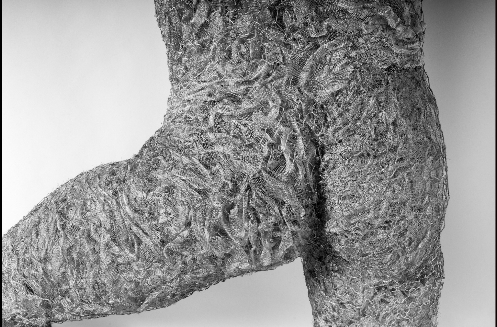
Francie Allen, No Exit (detail view), 2016, wire netting, wire screening, 80 x 38 x 22 in.