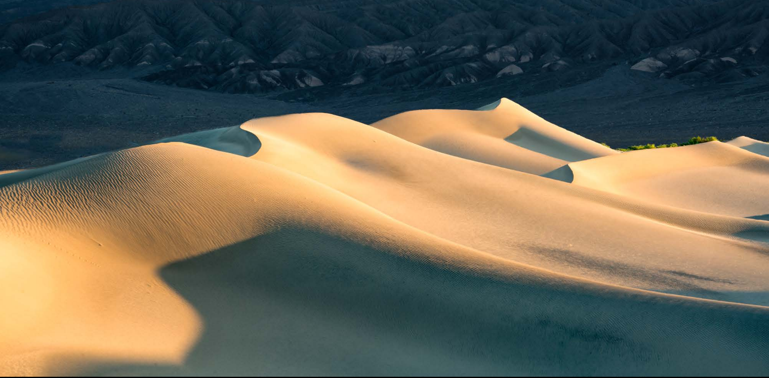
Elaine Sussman Belvin, Mesquite Dunes Sunset , 2015, photography, 15 x 30 in.