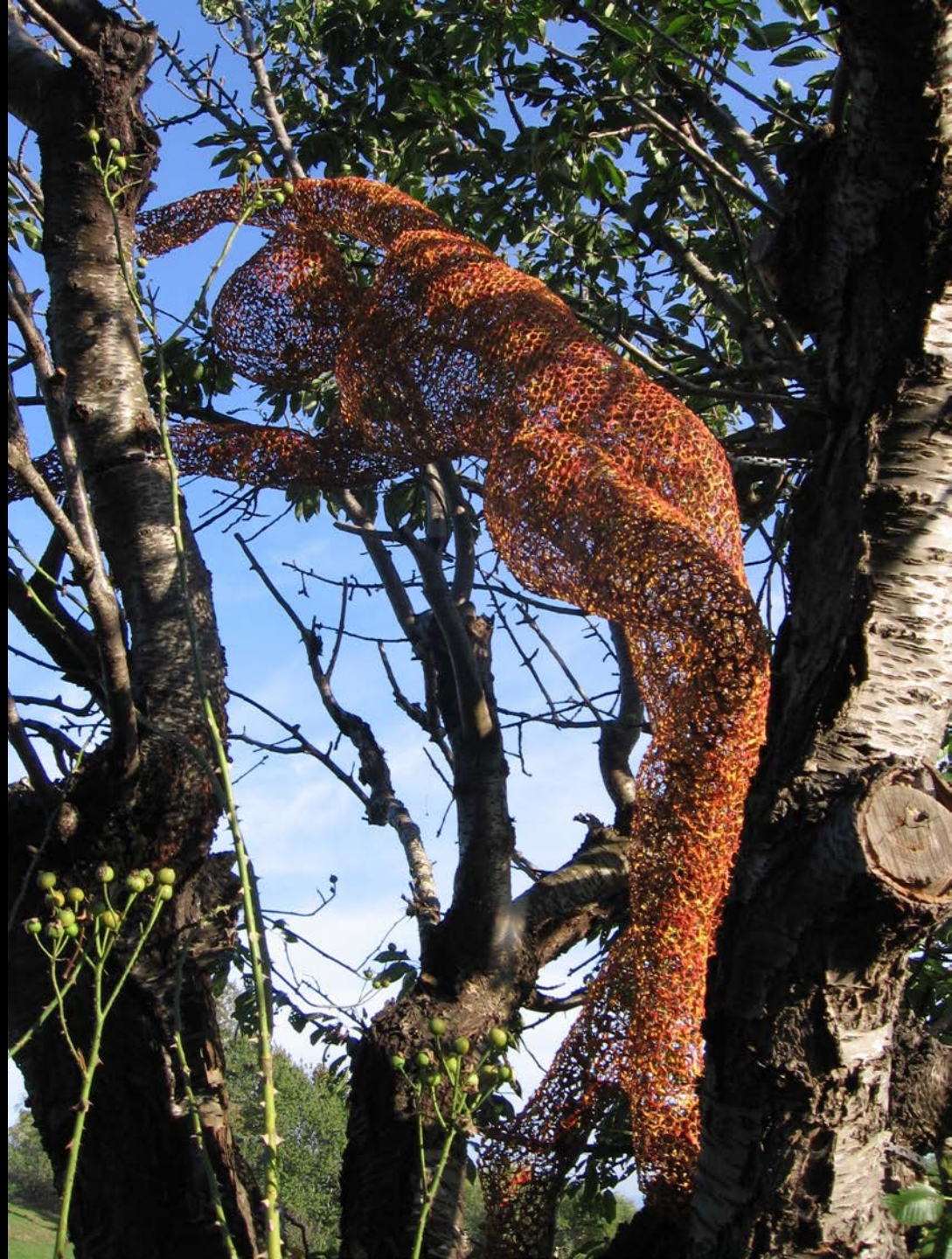
Francie Allen, Cherry Tree Dancer 1 , 2015 Wire netting, gel medium, 96 x 38 in.