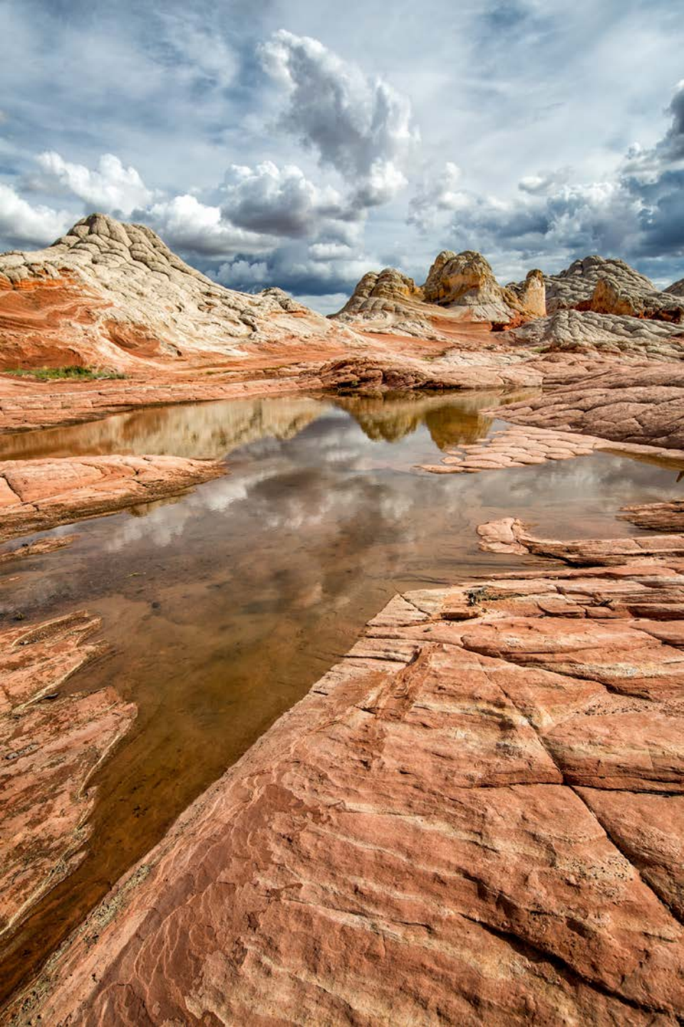
Elaine Sussman Belvin White Pocket Elements , 2015 Photography, 24 x 16 in.