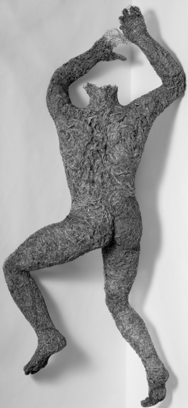
Francie Allen, No Exit , 2016, wire netting, wire screening, 80 x 38 x 22 in.