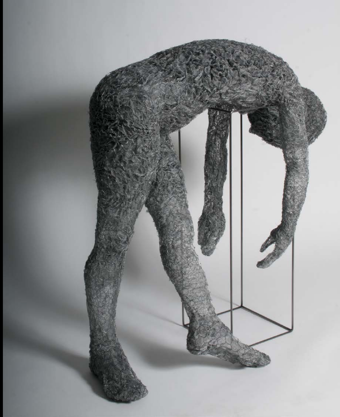
Francie Allen, Dancer in Collapse , 2017 Wire netting, wire screening, 38 x 39 x 2 in.