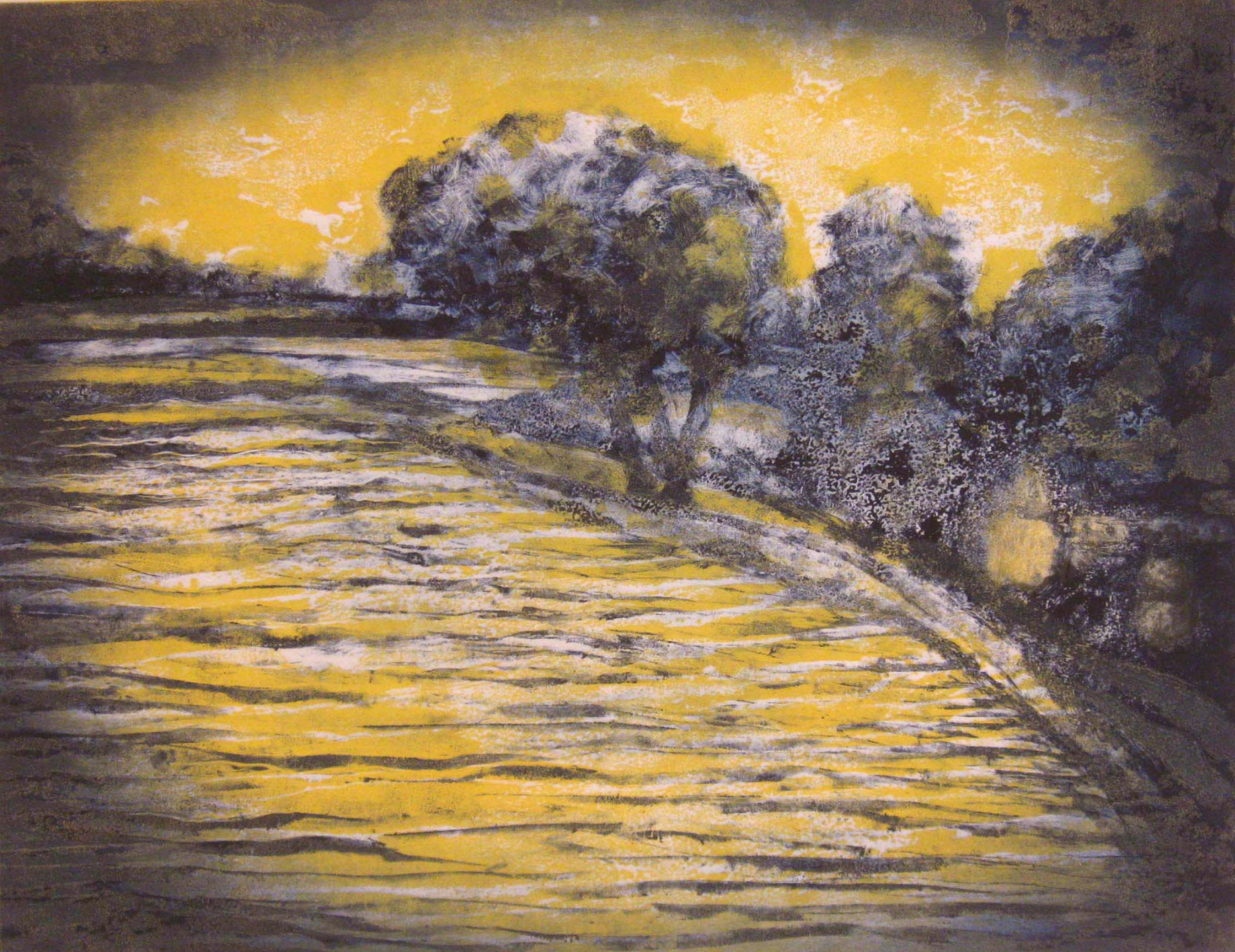
Jane Banquer Island Afternoon , 2010 Solar plate etching 12 x 20 in.