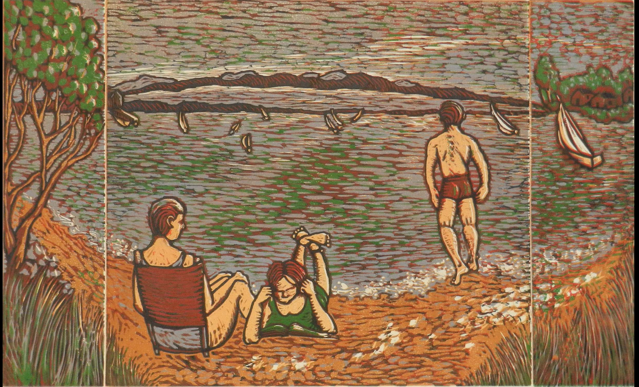
Jane Banquer, Island Players , 2014, reduction woodcut, 12 x 20 in.