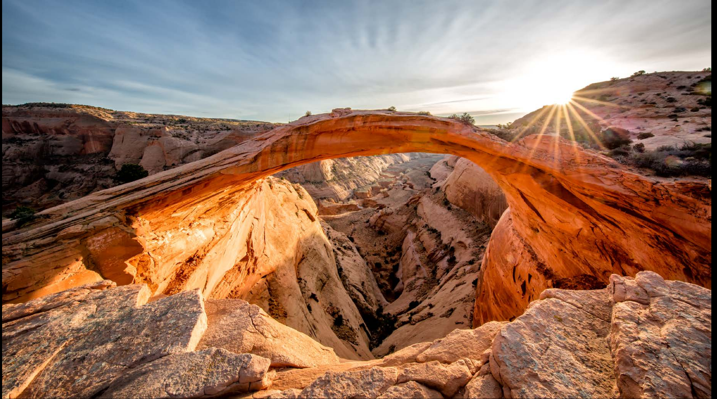
Elaine Sussman Belvin, Eggshell Arch VIII , 2015, photography, 13.5 x 24 in.