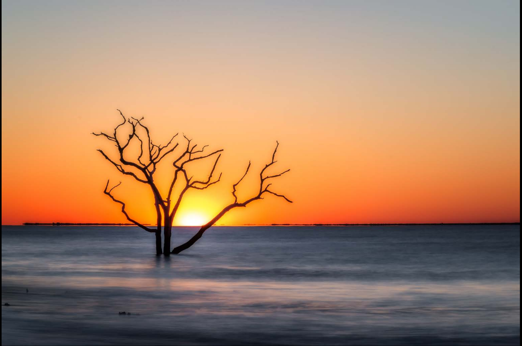
Elaine Sussman Belvin, Edisto Beach Sunrise , 2016, photography, 16 x 24 in.