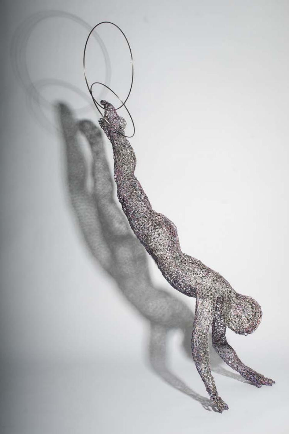
Francie Allen, Dancing through Hoops , 2017 Wire netting, gel medium, steel, 60 x 48 x 24 in.