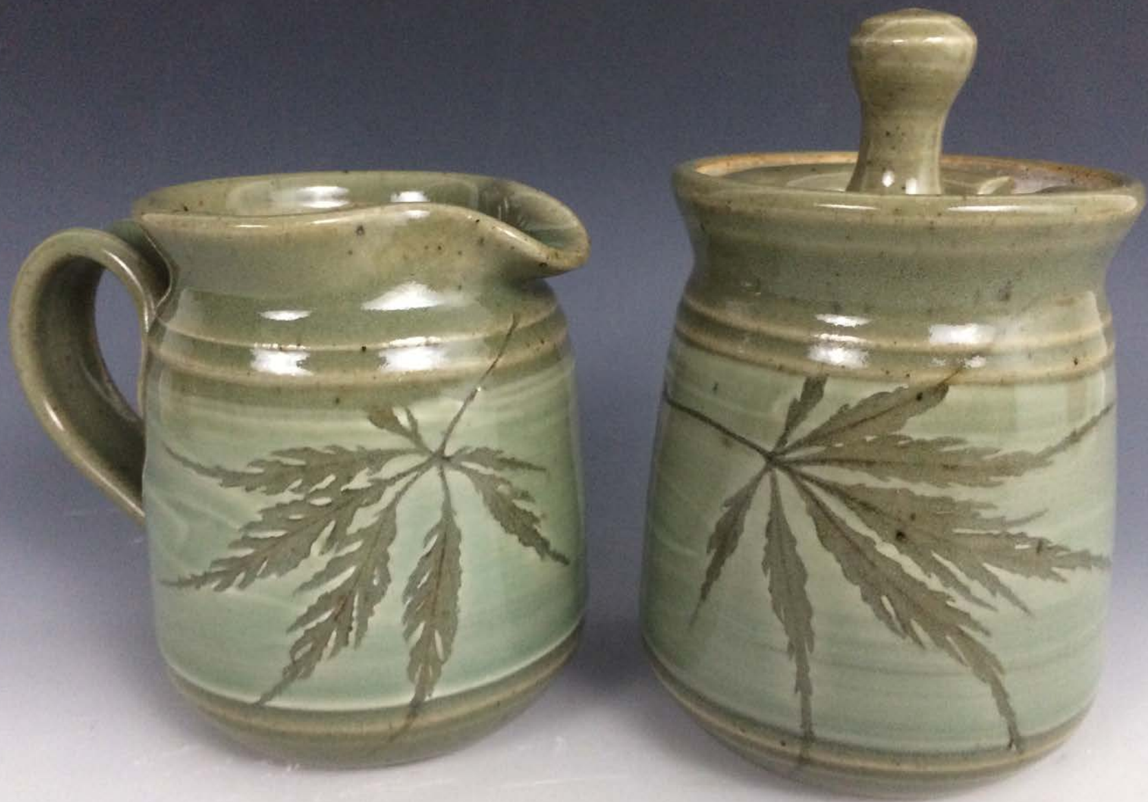
Sarah de Besche Thrown ceramic creamer and sugar, leaf motif, 2016 Stoneware/porcelain, celadon glaze, 5 x 7 x 3 in.