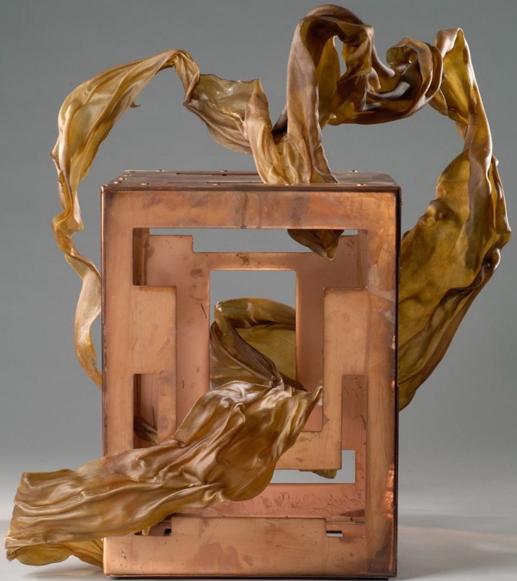
Rosalyn Driscoll, Pandora's Box 9 , 2007 Coppered steel, rawhide, 30 x 26 x 28 in.