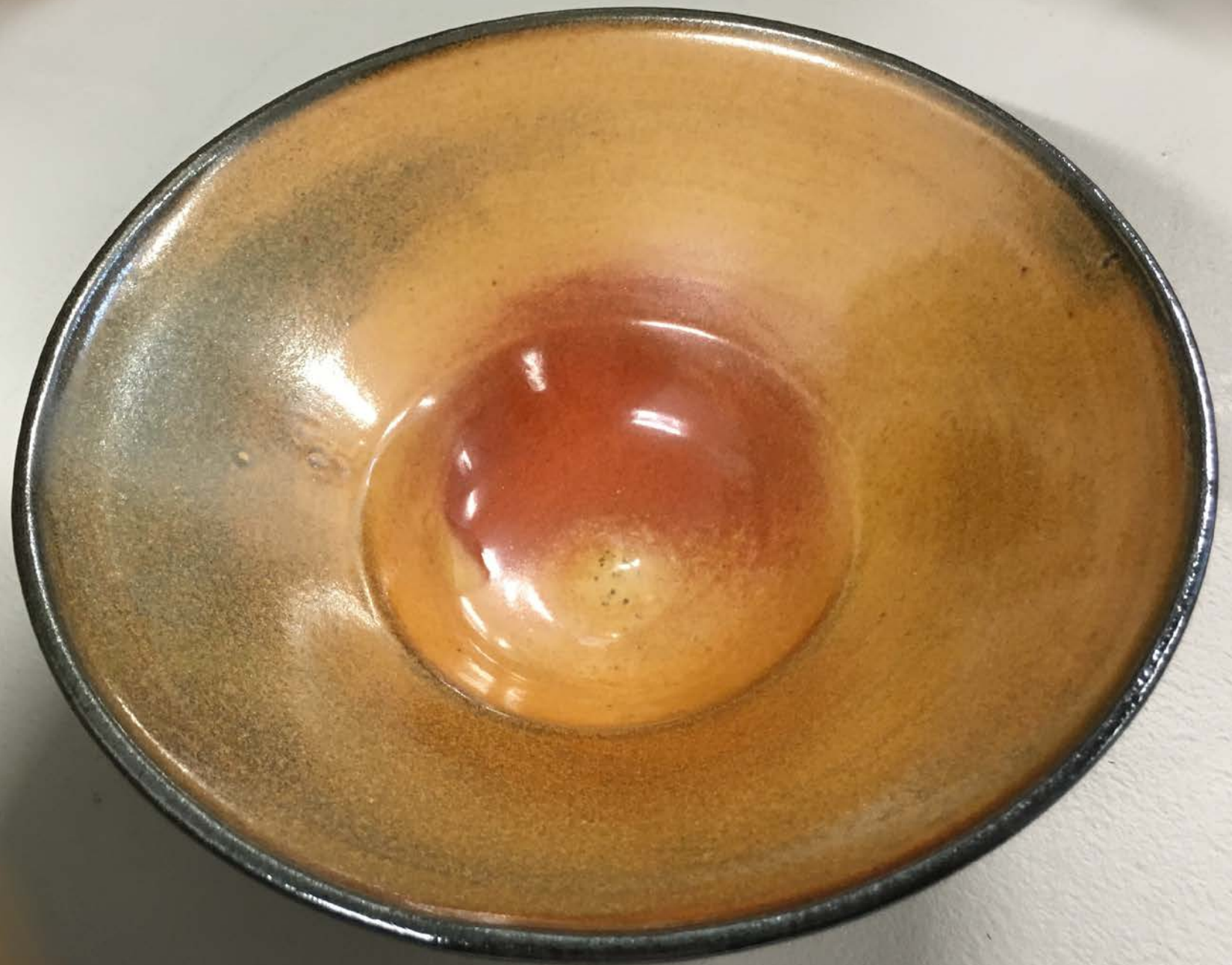
Sarah de Besche Thrown bowl, 2016 Porcelain, red shino glaze 4 x 8 in.