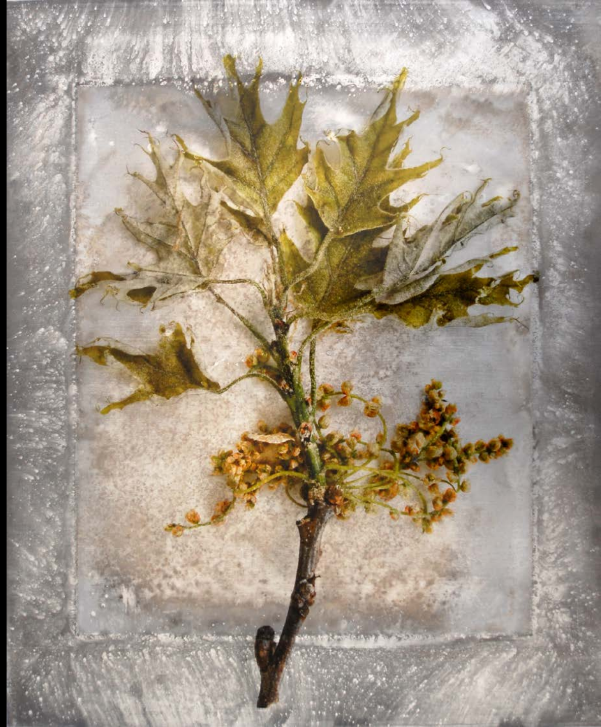
Alida Fish, Oak Flowers , 2017 Photograph on oxidized metal, 27 x 23 in.