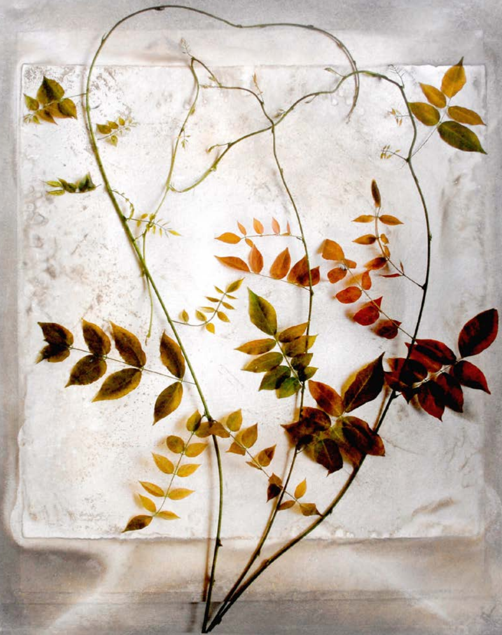
Alida Fish, Wisteria , 2017 Photograph on oxidized metal, 27 x 23 in.