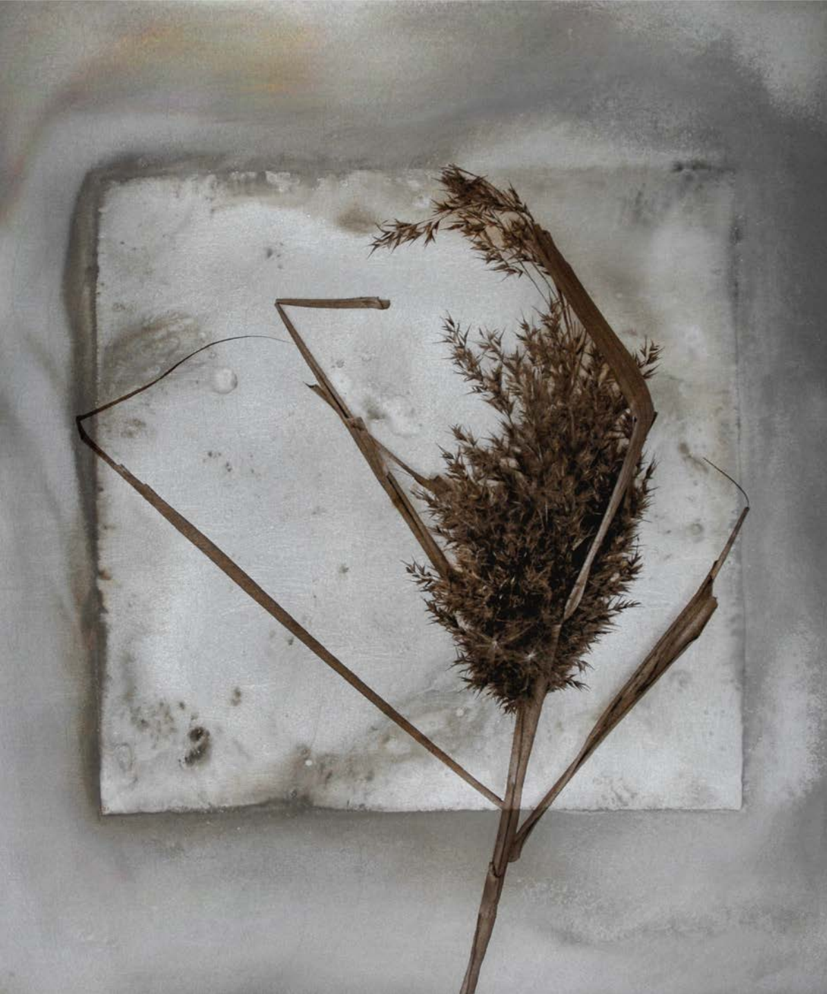
Alida Fish, Flag Grass , 2016 Photograph on oxidized metal, 27 x 23 in.