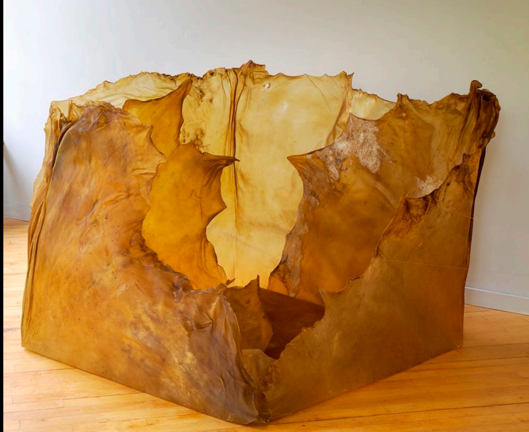
Rosalyn Driscoll, Homage to Turner 2008, rawhide, 48 x 57 x 56 in.