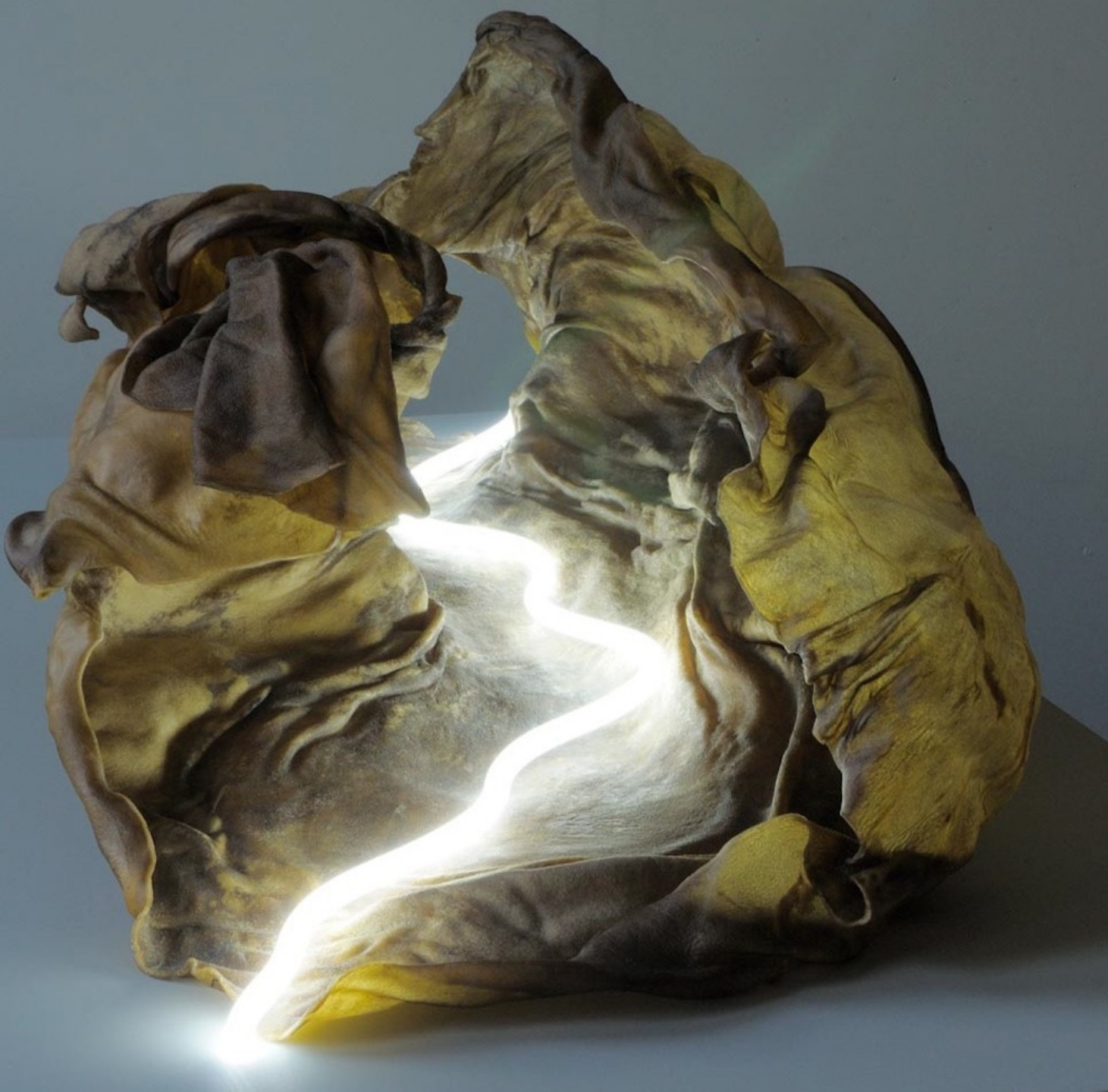
Rosalyn Driscoll Emptiness of Fire , 2010 Rawhide, neon, 12 x 41 x 17 in.