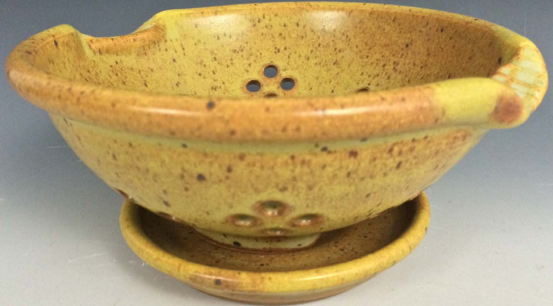
Sarah de Besche Thrown berry bowl with saucer, 2016, stoneware, yellow glaze, 5 x 9 x 9 in.