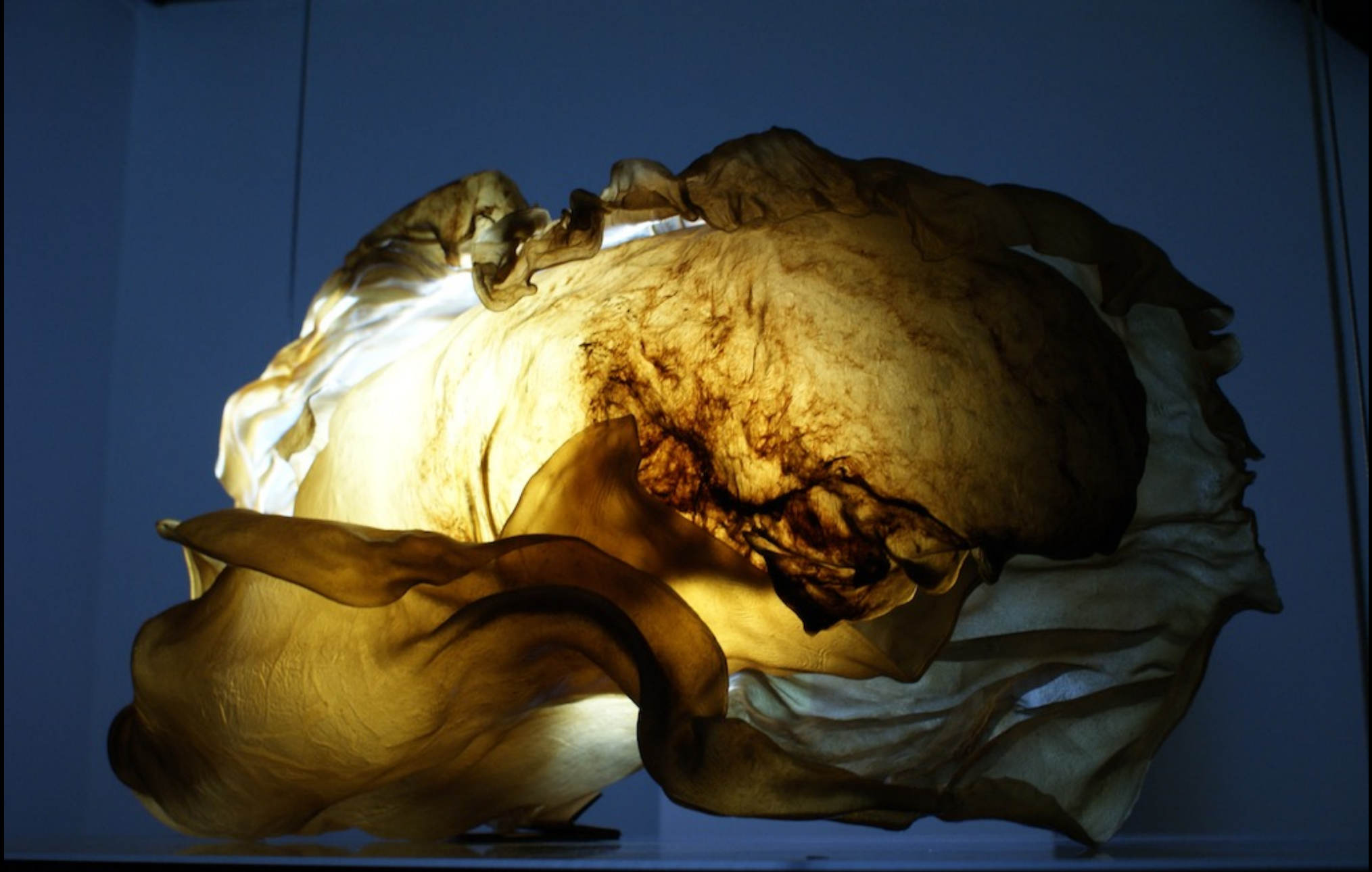
Rosalyn Driscoll, Threshold , 2012, rawhide, video, 16 x 28 x 15 in.