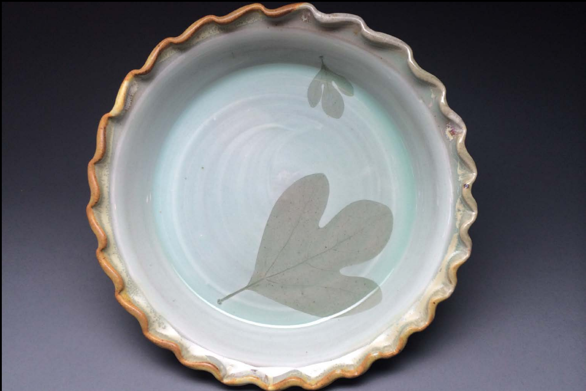
Sarah de Besche, thrown ceramic pie plate with leaf motif, 2016, stoneware/porcelain, celadon glaze, 2 x 10 in.