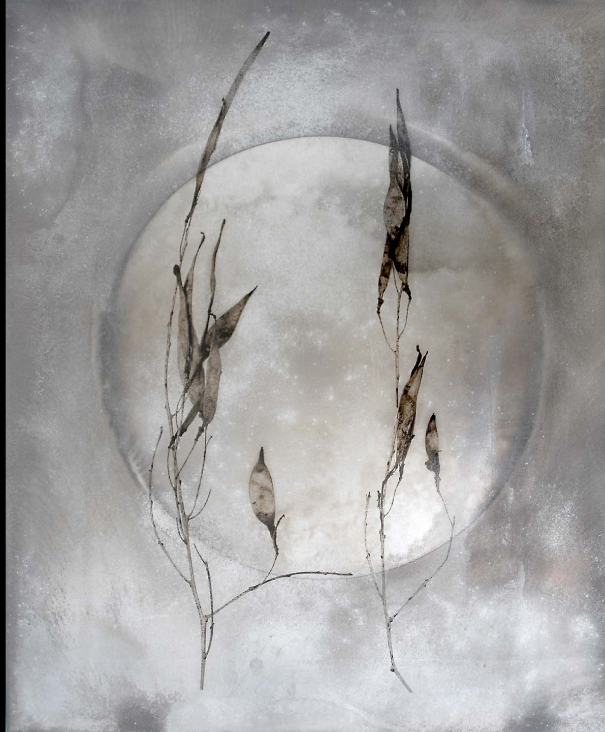
Alida Fish, Winter Leaves , 2016 Photograph on oxidized metal, 27 x 23 in.