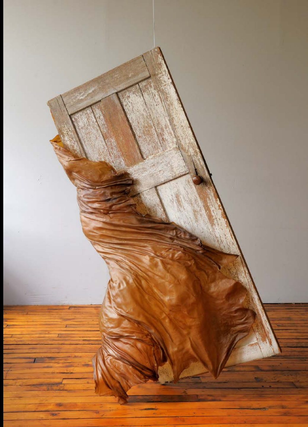
Rosalyn Driscoll, Whether , 2012, wood, rawhide, 82 x 57 in.