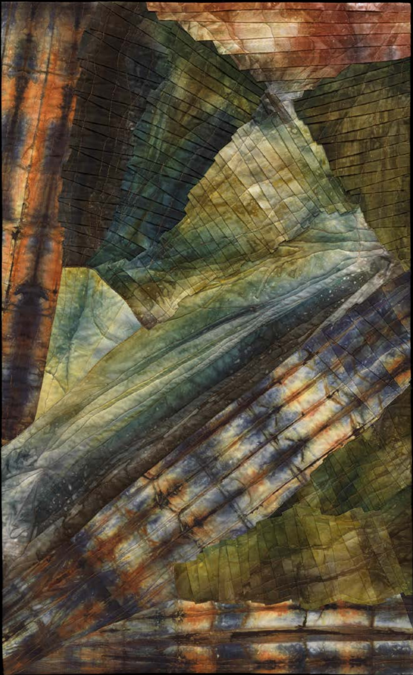
On view in the Alumnae House Donna Lopatin Radner Earth Water and Stone #3 , 2013 Fiber, 44 x 27 in.