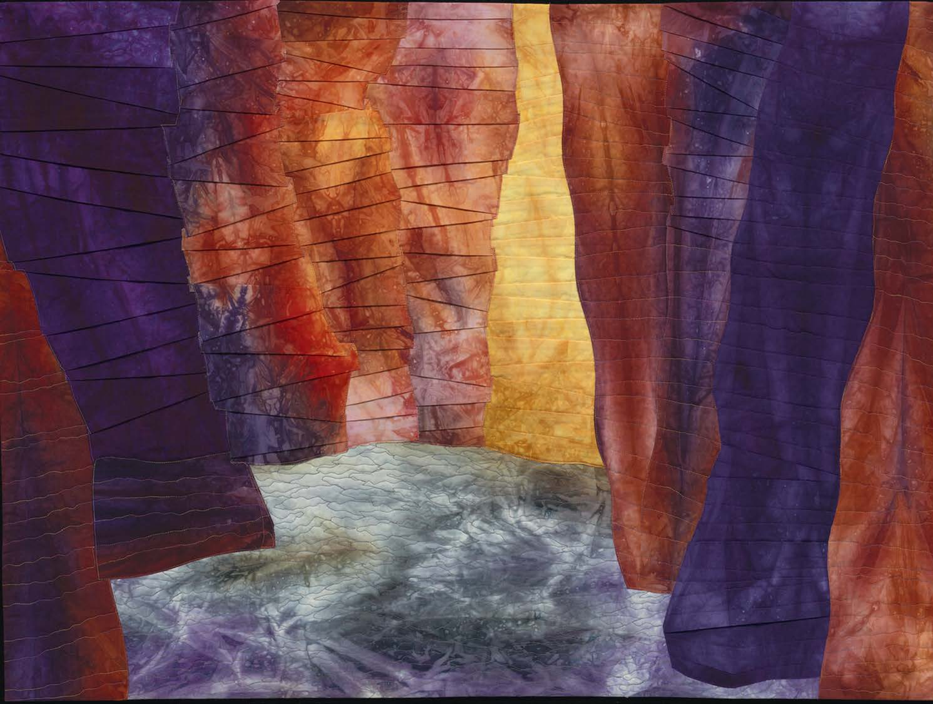
Donna Lopatin Radner Inside the Canyon , 2012 Fiber, 31 x 42 in.