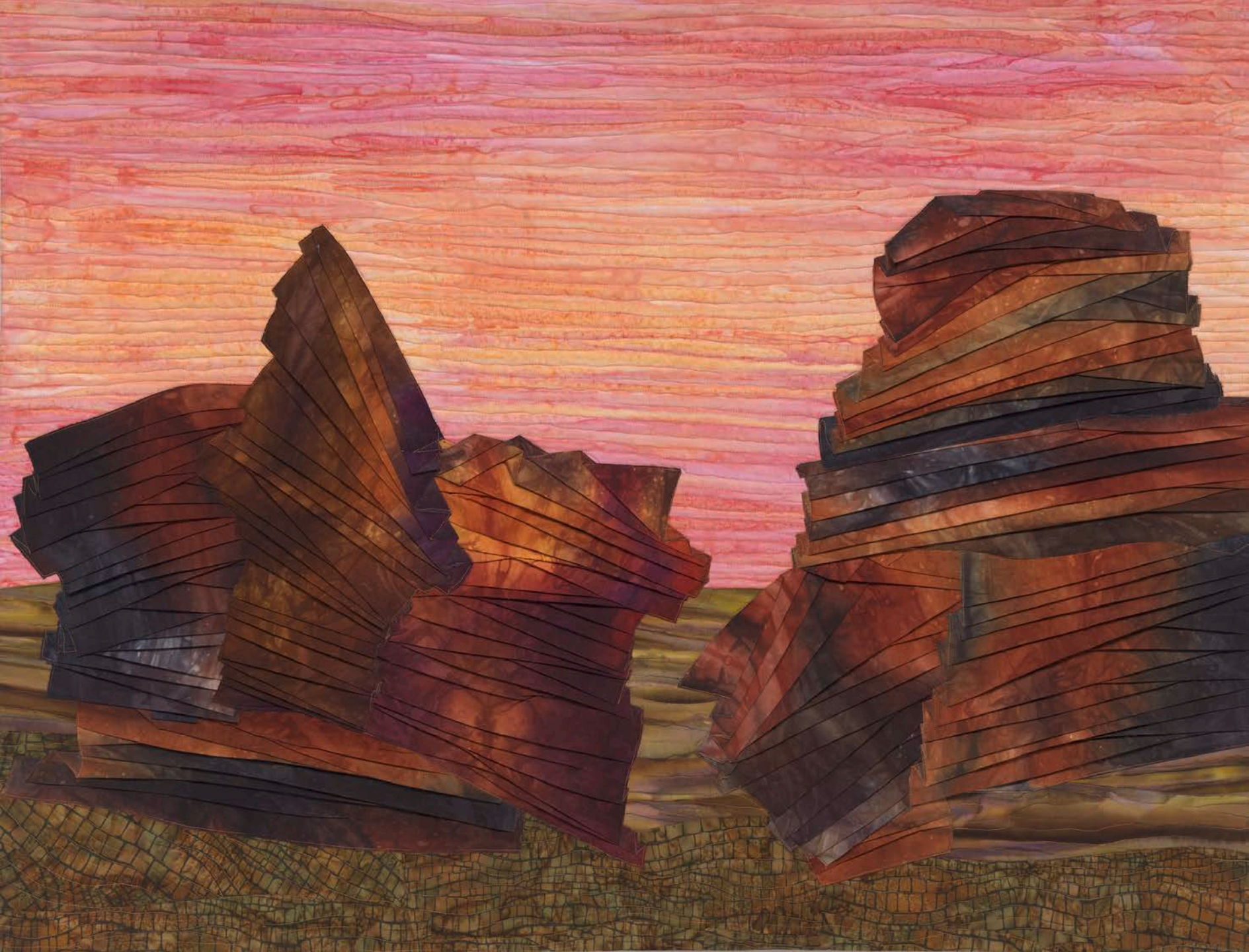
Donna Lopatin Radner The Conversation , 2015 Fiber, 32 x 42 in.