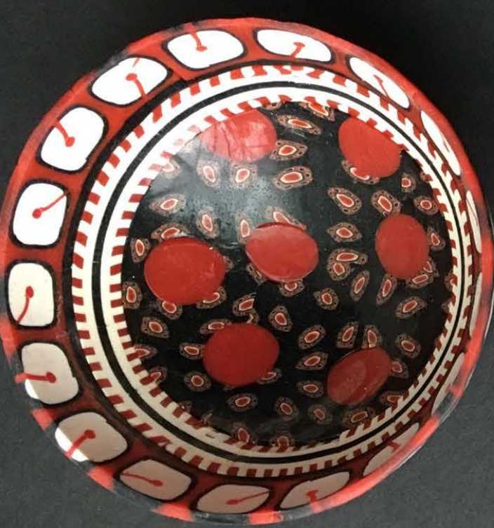
Laurel Lancaster Swetnam, Red and black bowls , 2016, polymer clay, 11 x 9 x 4 in.