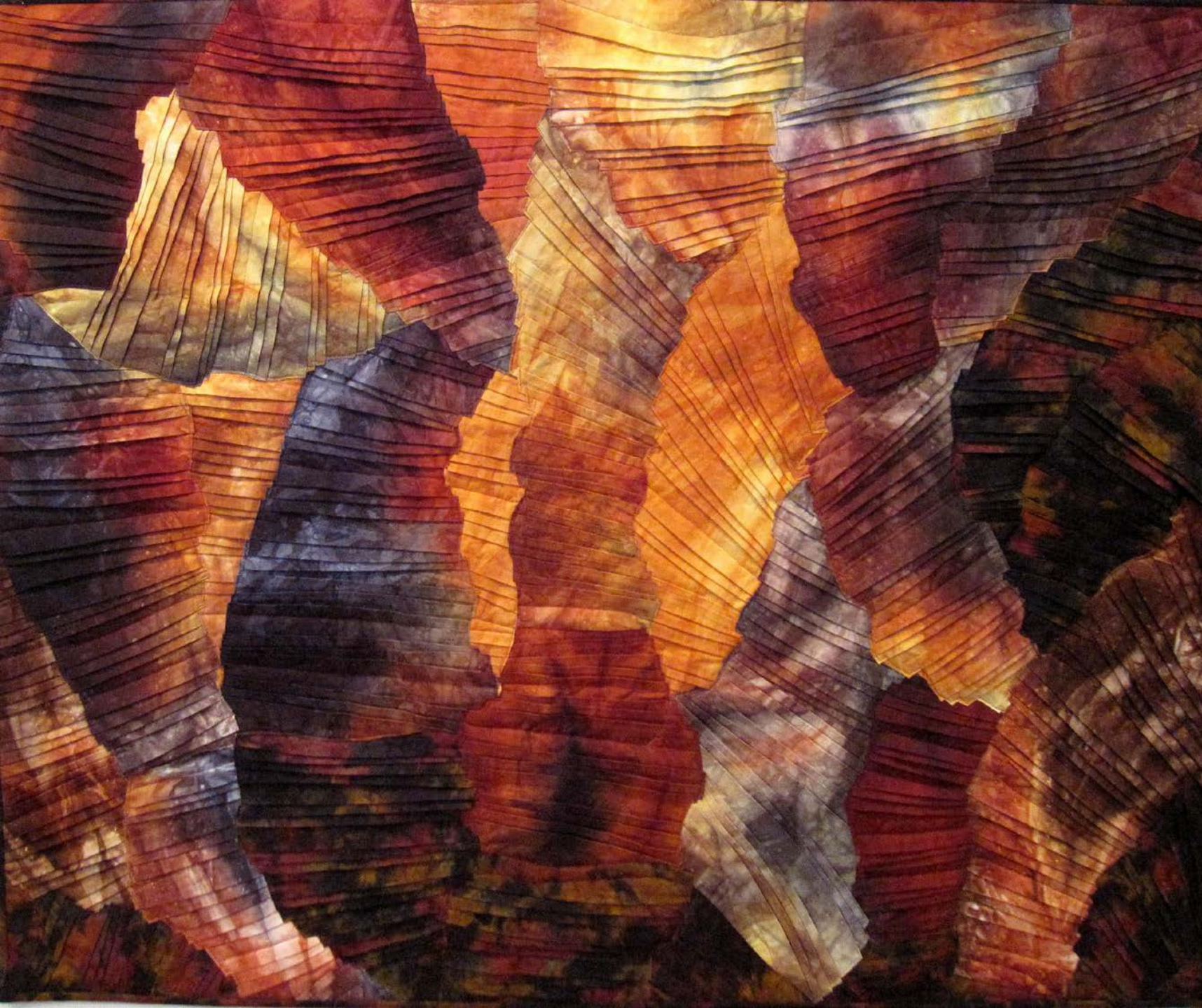
Donna Lopatin Radner Twisting Canyons 1 , 2010 Fiber, 37 x 44 in.