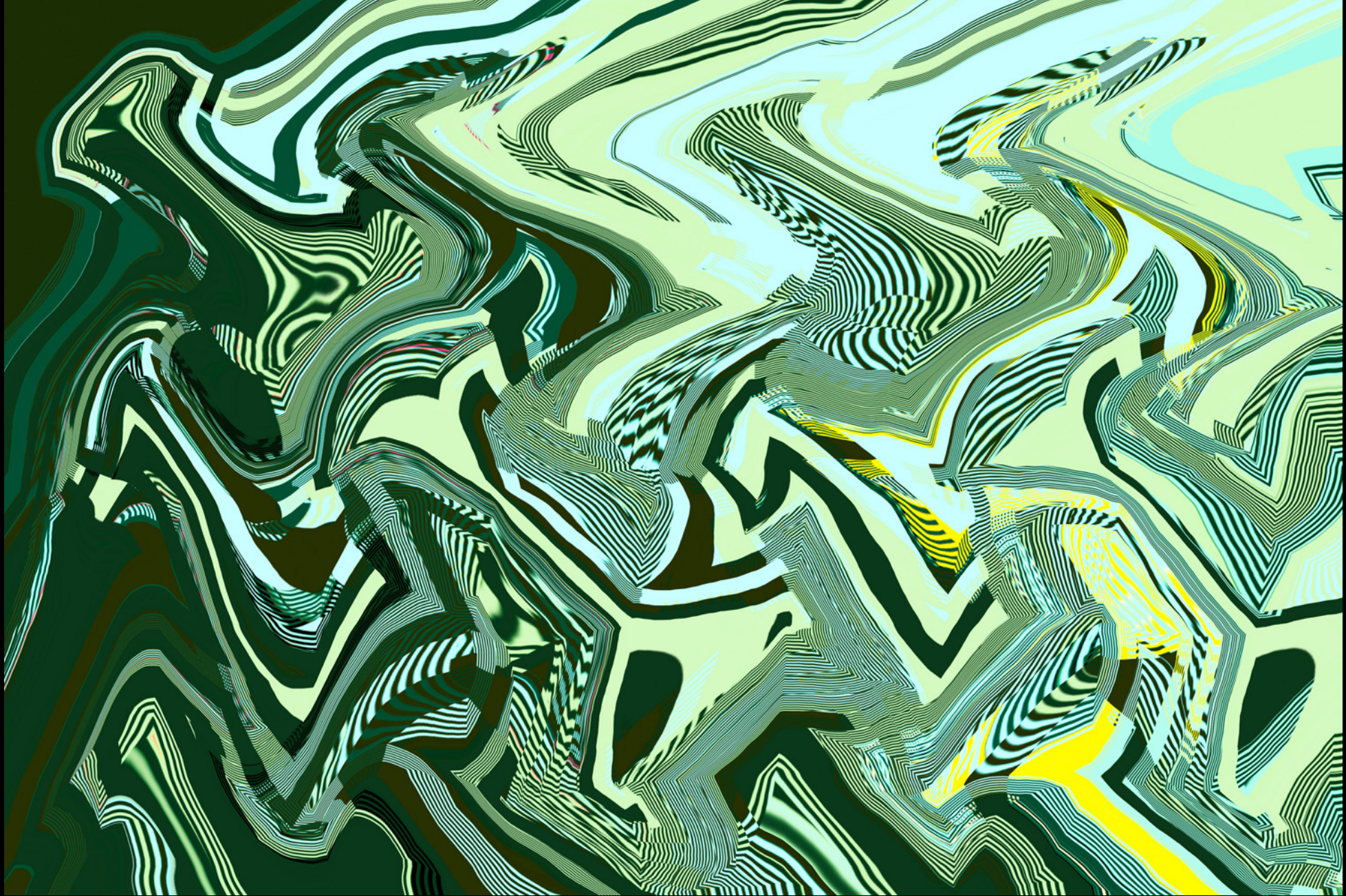
Leah Siegel (Louise Siegel), Re-Vision 40g , 2016, digital drawing, pigments infused into aluminum, 20 x 30 in.