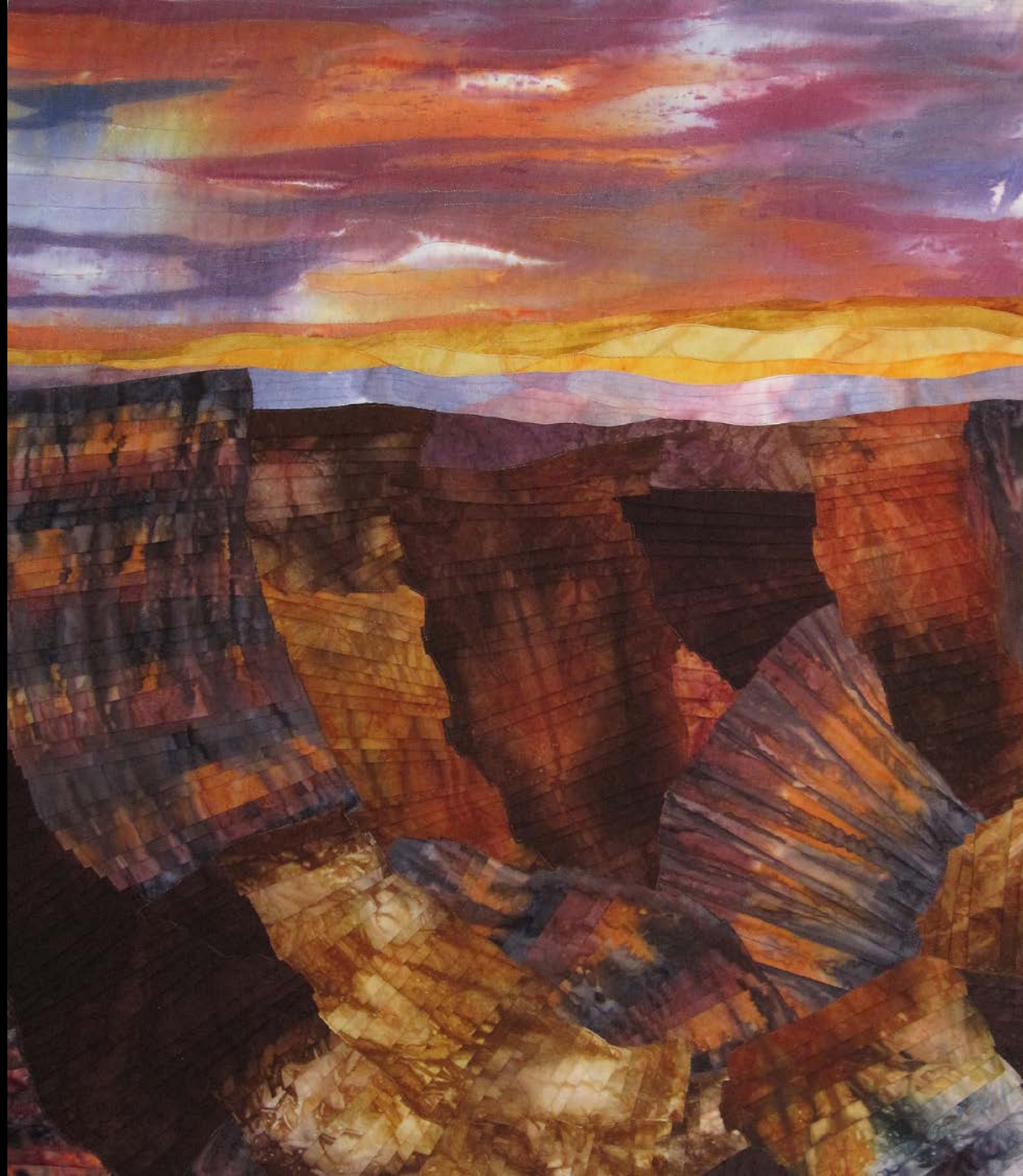
Donna Lopatin Radner Grand Canyon Sunset , 2011 Fiber, 31 x 36 in.