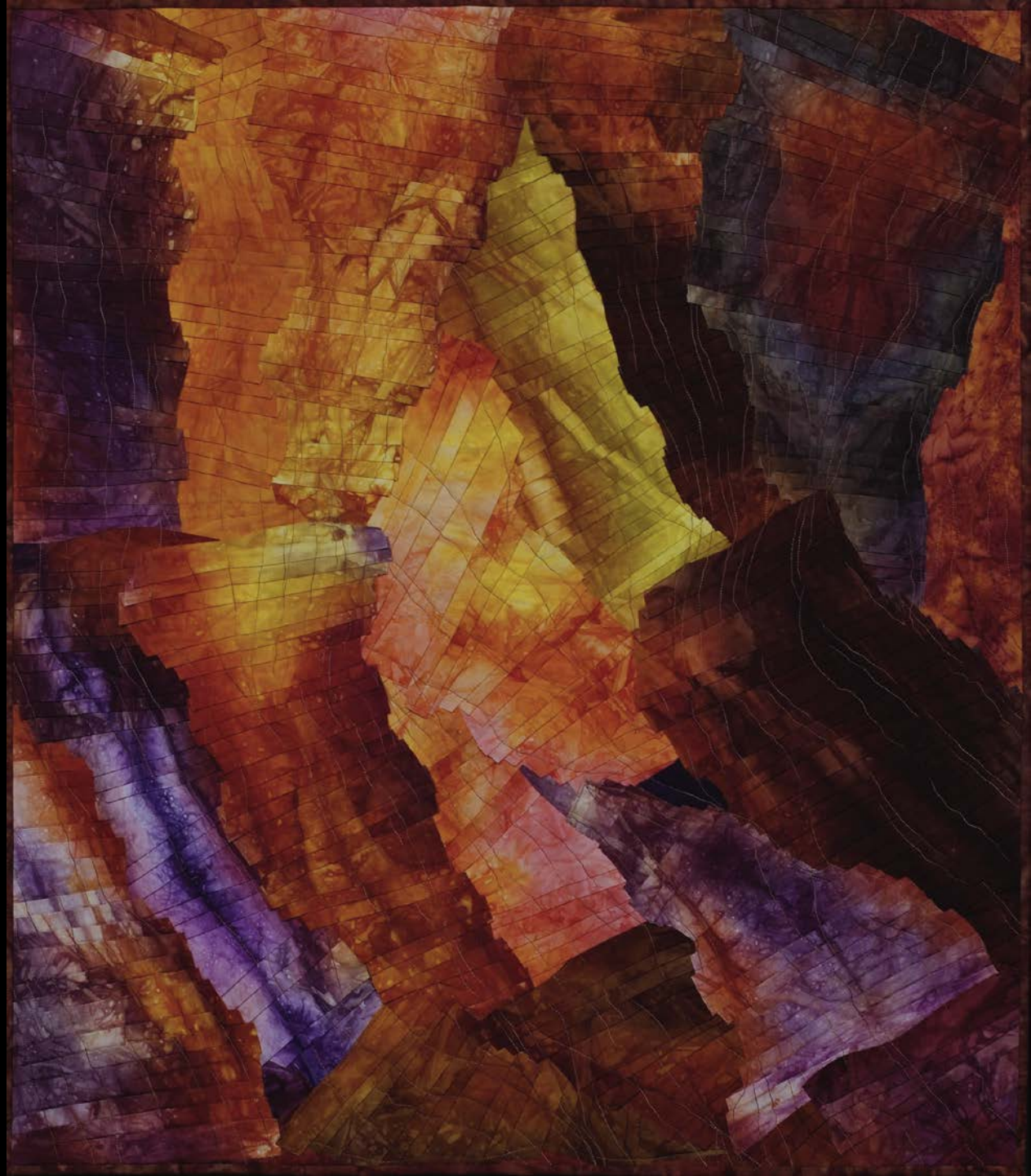
Donna Lopatin Radner The Light Within 4 , 2012 Fiber, 34 x 29 in.