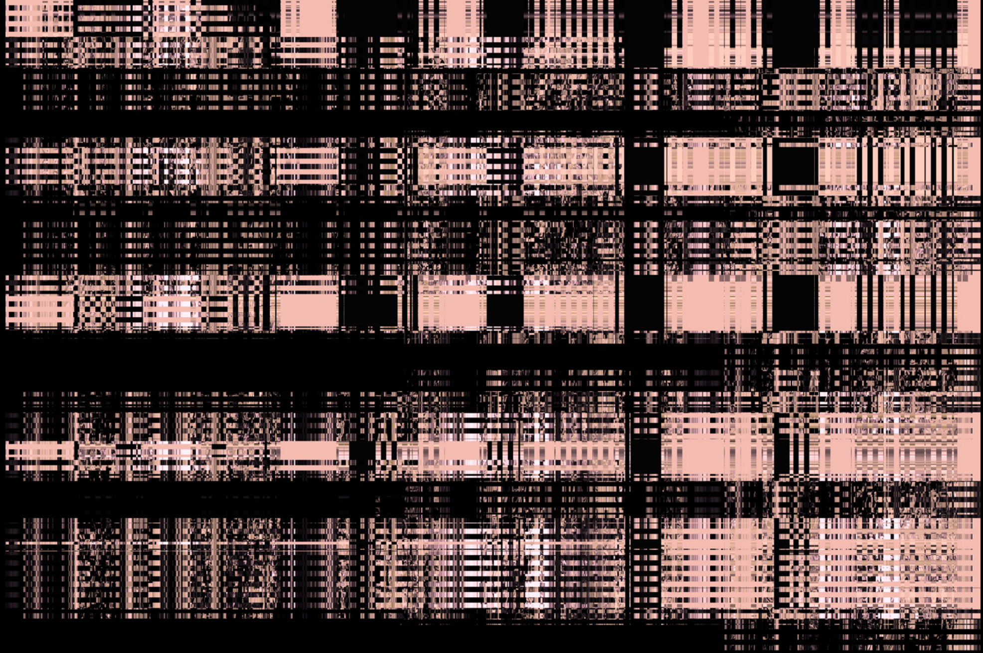
Leah Siegel (Louise Siegel), Re-Vision 17 , 2015, digital drawing, pigments infused into aluminum, 20 x 30 in.