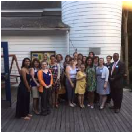
At the annual meeting!!!

We are always looking for people to conduct interviews or go to college fairs. Let us know if you might want to get involved. smithclubworchester@gmail.com