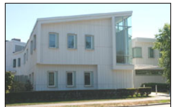
New Campus Center --- built in 2003.

I am a frequent visitor to Northampton because my 93 year old mother still lives in her house near Smith College—the house where I was destined to live another three years until I self-financed a move into our new senior house, Mary Ellen Chase. On a recent visit I took a walk down memory lane. Julie Nixon and David Eisenhower have long-since moved out of their ground floor apartment just down the street from Baldwin, but the building is still there. Secret service men no longer follow Julie around campus at a discrete distance. The “new” campus center begins to seem like it has always been there.