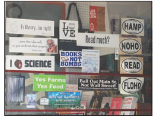
Signs of the times!

But you might not know that the town, now commonly known as “Noho,” has become a popular year-round tourist destination, overflowing with restaurants, shops and galleries and worth perhaps an extra day or two of your time when you make your way to the Pioneer Valley for our next reunion. Touted as “one of the more culturally interesting towns in Massachusetts” and perhaps “one of the most gay-friendly cities in the country” by Julie Hatfield, free-lance travel writer with the Boston Globe, it has also been named one of the “Top 23 Arts Destinations” by American Style Magazine.