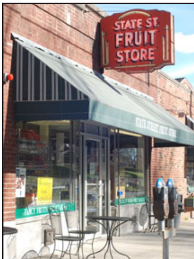
Some things never change.