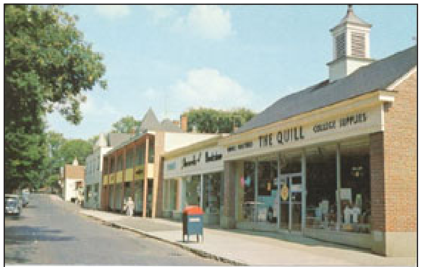
Green Street then --- the Quill Bookstore.

Noho has a vibrant cafe culture. The old fire station on Masonic Street has been transformed into the Woodstar Cafe and is always humming with activity, or try Haymarket Cafe on Main. Green Street has changed to accommodate the new engineering building and the Quill is long gone, but I recommend 40 Green Street for a wonderful french cafe experience. If you’d prefer a leisurely dinner in downtown Noho before or after our reunion, there are many ethnic restaurants and contemporary New England and vegan/vegetarian options. And Wiggins Tavern at the Hotel Northampton is still there! For the added nostalgia factor try India House Restaurant at 45 State Street—it used to be our old standby Carlos. Or for a quick and delicious lunch of local and organic foods try the String Bean on Main Street. It is a new favorite of mine. We hope this will give you a sample of the new Northampton and help entice you back to Smith for our forty fifth reunion and even perhaps to extend your stay. And for a “proper cappuccino” on the way out of town heading towards I 91 and points south be sure to stop in at Northampton Coffee, 269 Pleasant Street, to get one for the road.