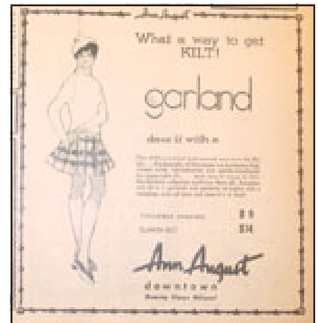
Ann August 1969 - check the prices! Sweater $9; Kilt $14

Hampshire House has long since been moved to another out of the way corner of campus, and I am no longer wearing Tampax, but Look Park and Albright still stand. So does the State Street Fruit Store, just down the hill. Its ice cream counter, where you could then get cones for a nickel or two is long gone. For the best ice cream in town you now have to go all the way over to Herrell’s on Old South Street. It’s in the basement of McCallums—oops—I mean Thornes Marketplace, as it is now known—a bustling boutique mall. Newbury’s and Ann August have vanished, but try the specialty stores and galleries all along Main Street. In our day the only fine art on display was at the Smith College Art Museum. Now, for just one example, you can see an extensive collection of Leonard Baskin’s work at the wonderful R Michelson Gallery.