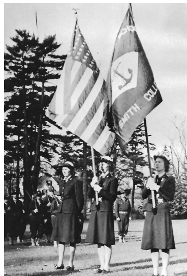
1945 Report on Wartime Activities at Smith College. Smith women formed 2 Platoons of Waves during WWII