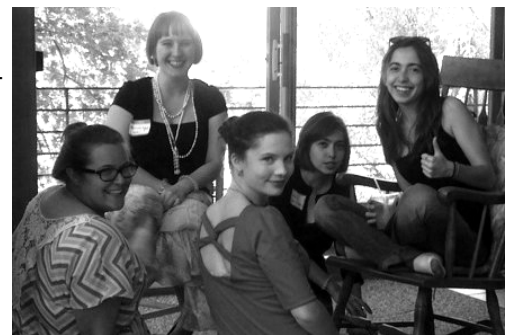
New Minnesota members of the class of 2016!