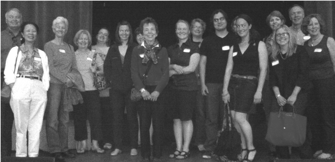
AT LEFT: The State and Orpheum Tour Group on stage, March 18.