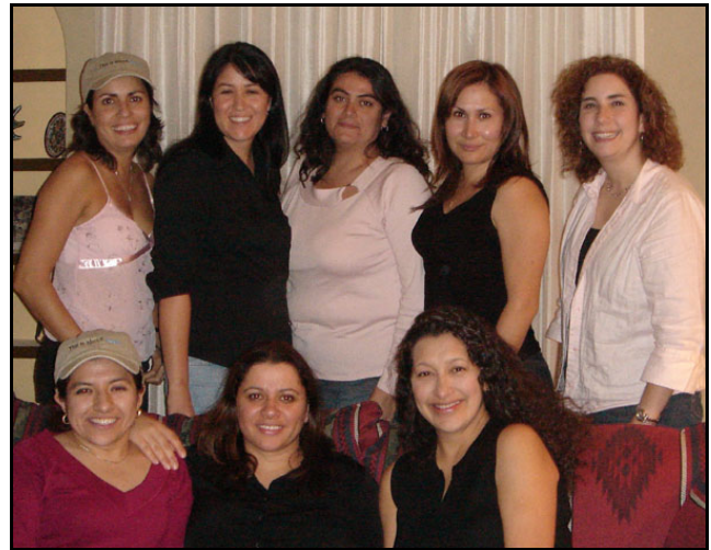
Our gathering reunited Smithies who graduated between 1991 and 1996. Those present included (back row left to right):