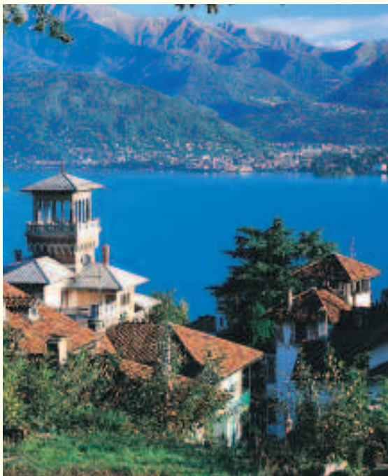
A stay in the beautiful town of Stresa on Lake Maggiore left an indelible impression on a young Ernest Hemingway.

From the deep-blue glacial lakes of Maggiore and Como to the bewitching Villa del Balbianello, from the medieval cobblestoned streets of Varenna to the modern sophistication of Milan, come and fall in love with the exquisite gem that is the Italian Lake District. You will be captivated forever.