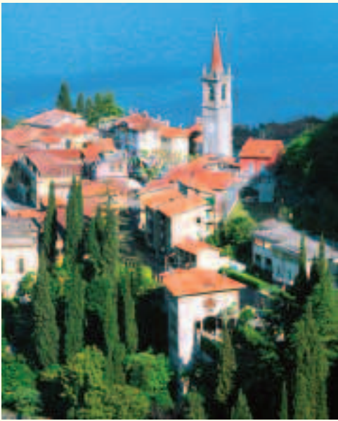
A breathtaking setting on Lake Como and an elegant blend of medieval monuments and 19th-century villas make Varenna one of Italy's most romantic villages.

keeps to herself," he misspoke. Como is a treasure the earth shares with all of us. Enjoy it for yourself on a private boat tour highlighted by stops in Bellagio and Varenna.