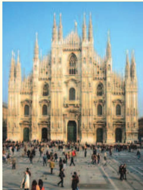
Visit Milan's towering Duomo, home to some of Italy's finest religious art.

CULTURAL ENRICHMENT: On an exclusive tour of the villa, absorb this idyllic property's magic and realize why this is one of the most famous pieces of real estate in the world.