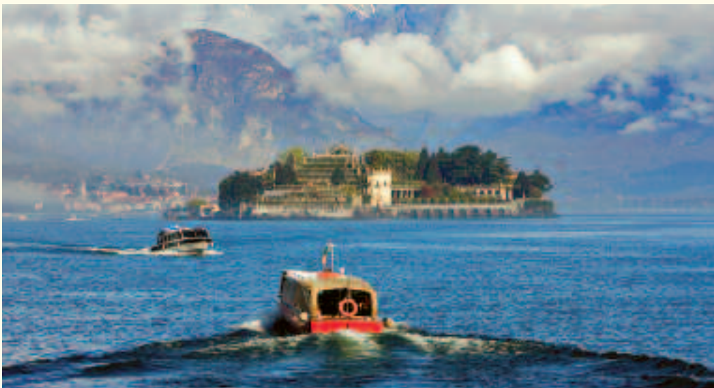
Isola Bella is the most spectacular of the three Borromean Islands, located on the Italian side of Lake Maggiore. Visit the magnificent 16th-century villa and stroll through one of the most beautiful gardens in the world.

Perhaps Italy’s most beautiful lake, Como is also its deepest. Sprinkled with Renaissance villas, its allure is enhanced by the charming towns of Bellagio and Varenna, both of which are located at the intersection of the three branches of the lake. Although William Wordsworth once rhapsodized that Lake Como is “a treasure whom the earth