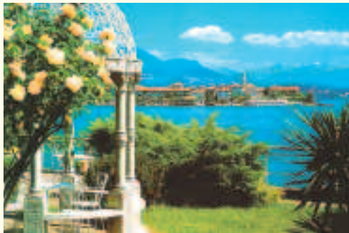
Picturesque lakes, Alpine views and grand villas define the beauty and charm of Lake Maggiore.