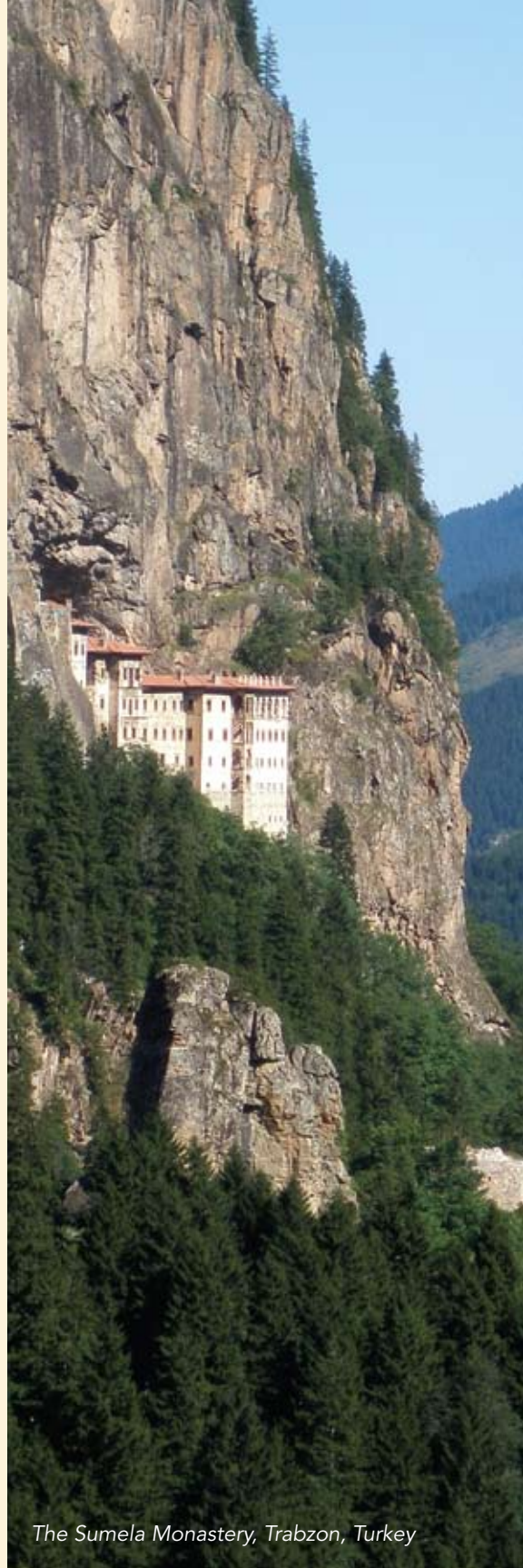
The Sumela Monastery, Trabzon, Turkey