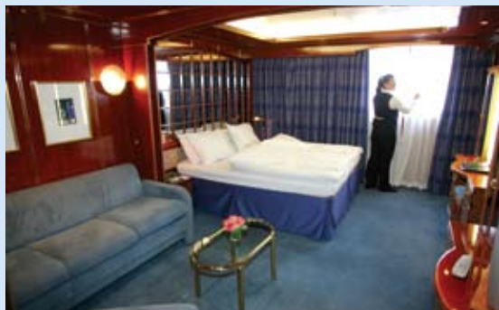
Category B Suite

Returning from excursions, enjoy complimentary refreshments, afternoon tea, and all-day coffee in The Club, a comfortable space for relaxation, with panoramic windows. Before or after dinner, savor a cocktail while the ship's pianist plays arrangements ranging from jazz to classical to contemporary. Corinthian II also features a library with Internet access, beauty salon, exercise area, elevator serving all decks, and a wraparound sun deck with Jacuzzi. The 75 European officers and crew ensure an atmosphere akin to a private club for the length of your voyage.