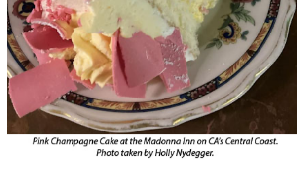
First Champagne Cake at the Mother's Day on Oct Central Coast

Our next 50th Birthday Zoom Party is scheduled for Sunday, November 6, 2022 at 4-5 p.m. Eastern. Please join us if you are able! These parties are also listed as events on our class Facebook page. Our last one will be on February 26, 2023, same time/zoom info.