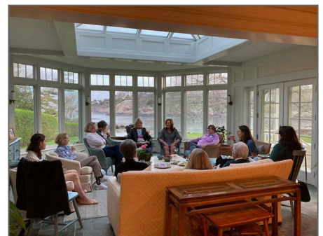
In Manchester-by-the-Sea, May 2024

December is our annual delicious potluck dinner and book swap. Membership is open to all members of the NSSCC in good standing. This year, Book Club added two members.