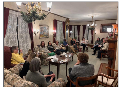
In Beverly, February 2024

Each November, members of the Book Club select books for the coming year (Jan–Nov) from books they have read. Meetings are held in person at the home of a Book Club member as often as possible, with an occasional Zoom meeting held for weather, health or other reasons.