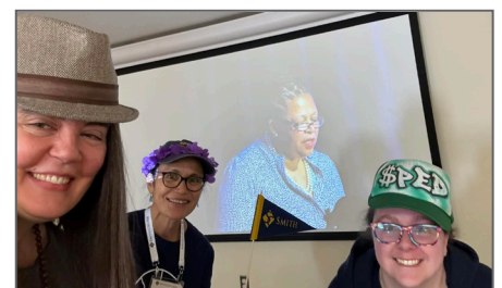
Meetup to watch “Rally Day” and an excuse to wear silly hats