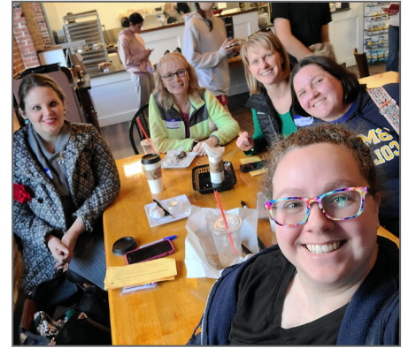
Meetup at Good Day Cafe, North Andover

Ideas include pizza & movie night, mini-golf & ice cream, paint & sip, and more. Contact Sarah Pedicini for details and to share your ideas at: sepedicini@gmail.com .