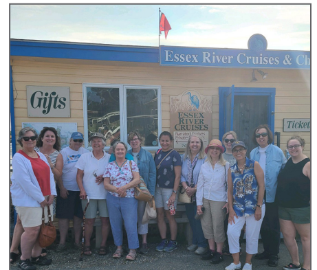
Meetup to cruise with Essex River Cruises