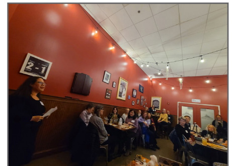
At Riverwalk, November 2023