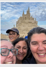
Sand Sculptures at Revere Beach July 23, 2024

We visited the deCordova Sculpture Park and Museum on July 10, 2024 for a storytelling performance. It was a nice surprise to see a former NSSCC member who now lives in Boston.