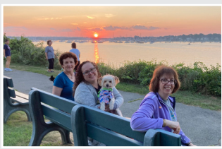
Sunset at Salem Willows August 27, 2024

We had a meetup at the Cape Ann Museum on September 22, 2024 with docent Leslie Beatty '78 as our guide for the exhibit, Women Artists on Cape Ann 1870-1970 . Afterwards we went to the Beauport Hotel for drinks on the deck.