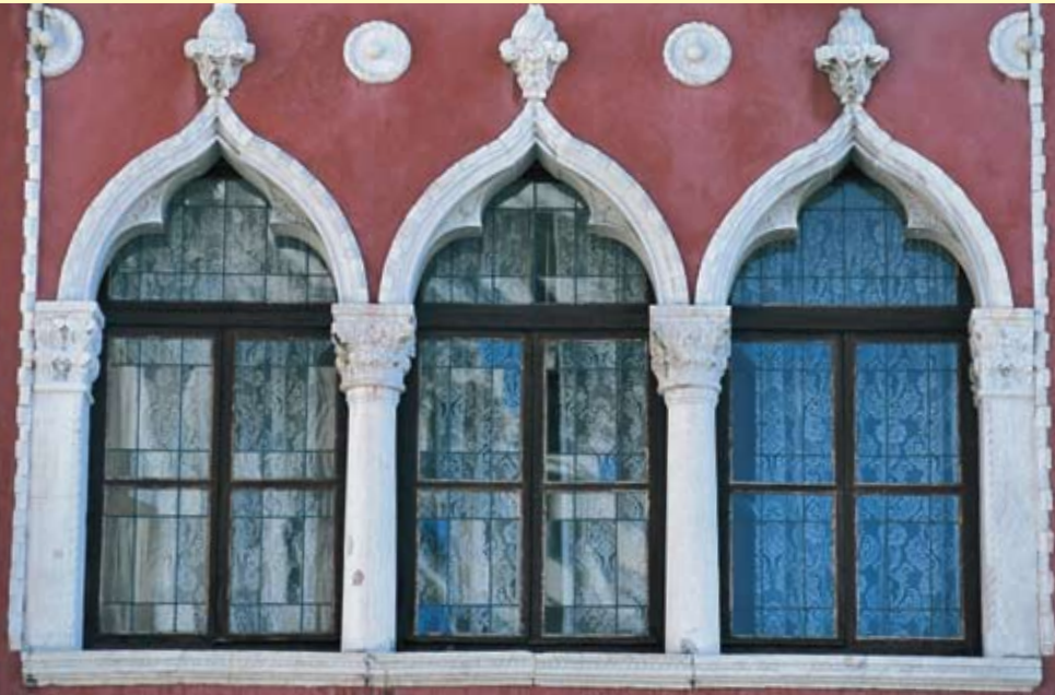
Architectural details, Piran, Slovenia