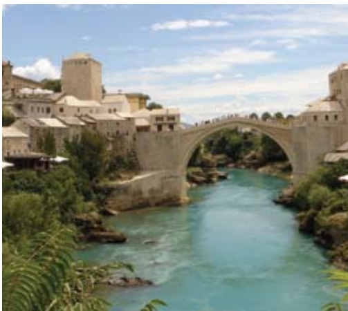
Stari Most, Mostar, Bosnia and Herzegovina